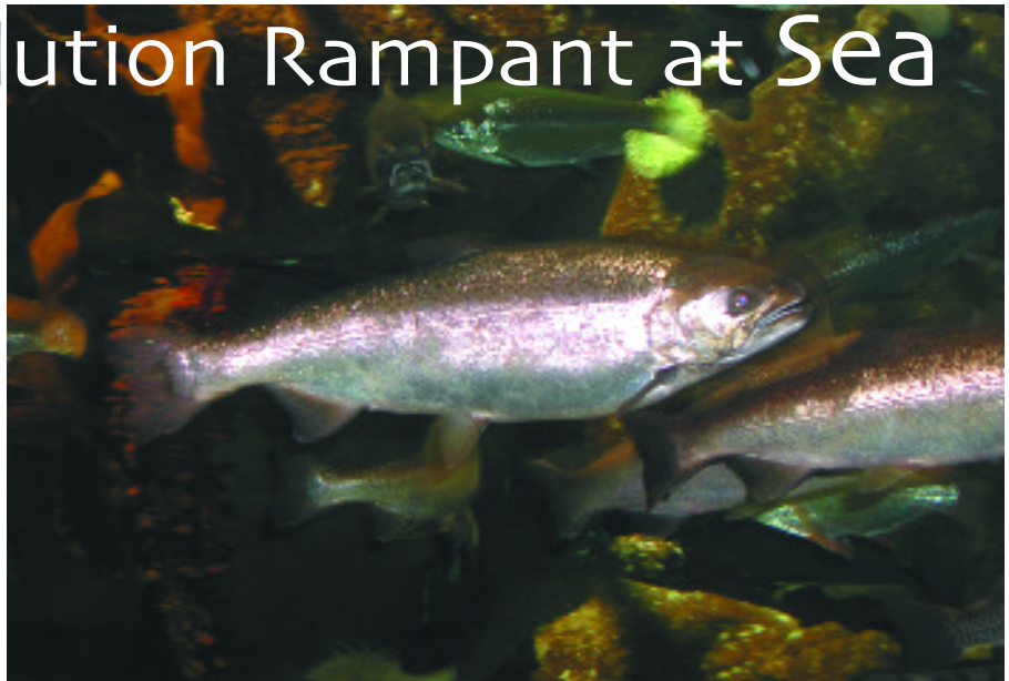
Because larger fish are more likely to be retained in fishing nets, reduction in average adult fish size has occurred over time in finfish like this Pacific salmon, as a result of selection against fast-growing individuals.

Most examples of rapid evolution are from land studies. But aquatic scientists are quickly realizing that rapid evolution is also rampant at sea. For instance, selective removal of large fish in commercial fisheries has led to