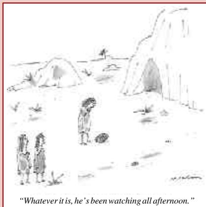
"Whatever it is, he's been watching all afternoon."