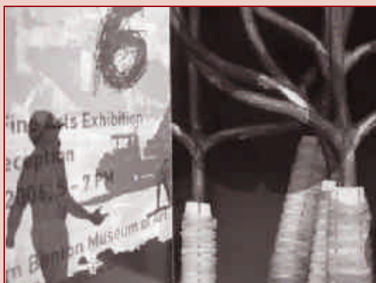
Detail: MFA exhibition announcement

Student Work in Communication Design At the University of Connecticut