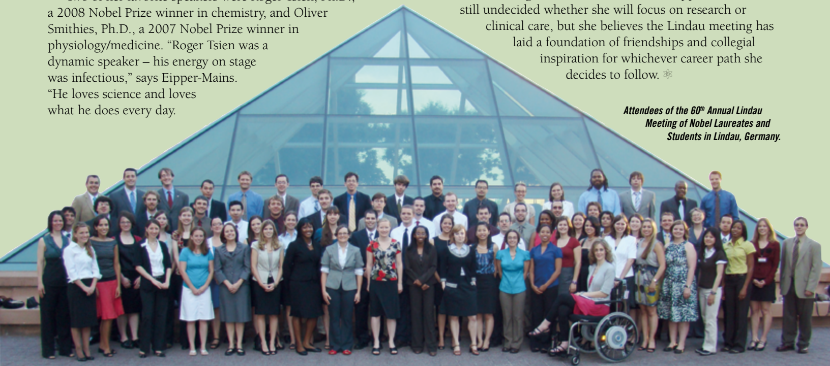
Attendees of the 60 th Annual Lindau Meeting of Nobel Laureates and Students in Lindau, Germany.