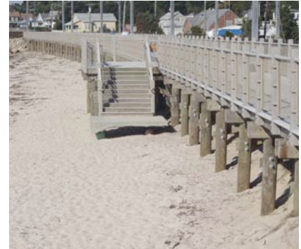
The wooden steps to the Boardwalk in Niantic are shown here in 2004 (L) and in 2007 (R). Engineers anticipated the seasonal rise and fall of the beach by including deep-rooted supports into the design of the lowest steps. Unfortunately, the steps now are undermined and exposed year-round.

increase in traffic. Beach time is a great time, but it also has many consequences.