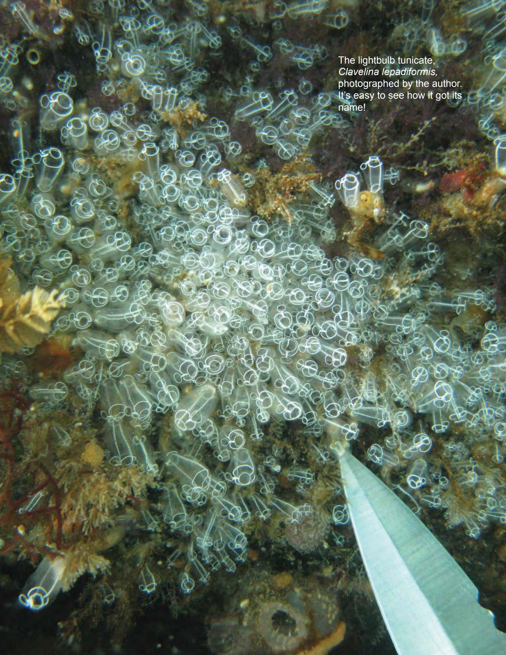
The lightbulb tunicate, Clavelina lepadiformis. It's easy to see how it got its name!