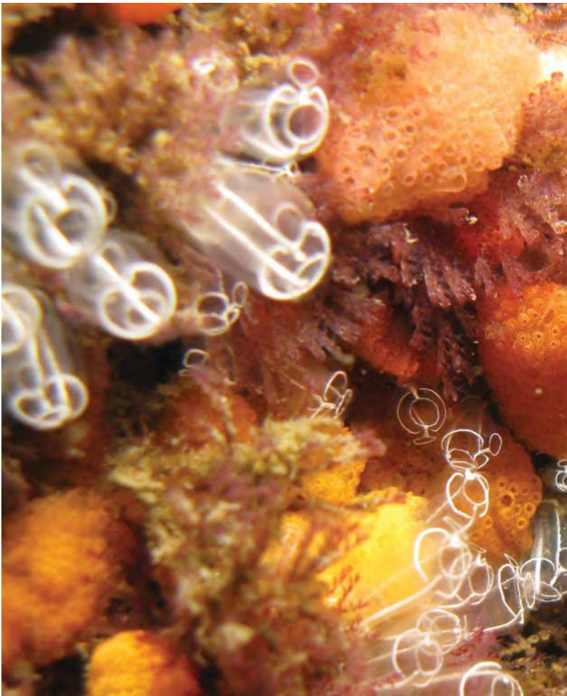
The light bulb tunicate ( Clavelina lepadiformis ) is both distinctive and conspicuous.

What does the invasion of Clavelina mean for our local biological communities and ecology? Animals like Clavelina can have many nasty consequences for the ecosystems that they invade, as well as for local industries which rely on the ocean. For instance, when Clavelina or other fouling organisms start growing in the intake pipes of power plants, this reduces the flow rate of water and decreases the efficiency of cooling. Running power plants at less efficient levels is costly to all of us and may be reflected in the price of a kilowatt that you need to run your own light bulb.