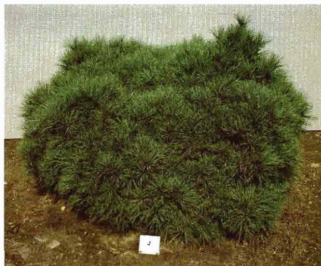
Fig. 4, Pinus strobus 'Blue Shag'

STORRS AGRICULTURAL EXPERIMENT STATION COLLEGE OF AGRICULTURE AND NATURAL RESOURCES, THE UNIVERSITY OF CONNECTICUT, STORRS, CT 06268