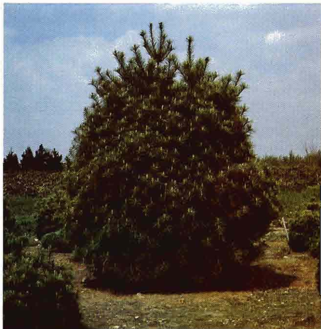
Fig. 1, Pinus strobus 'UConn'