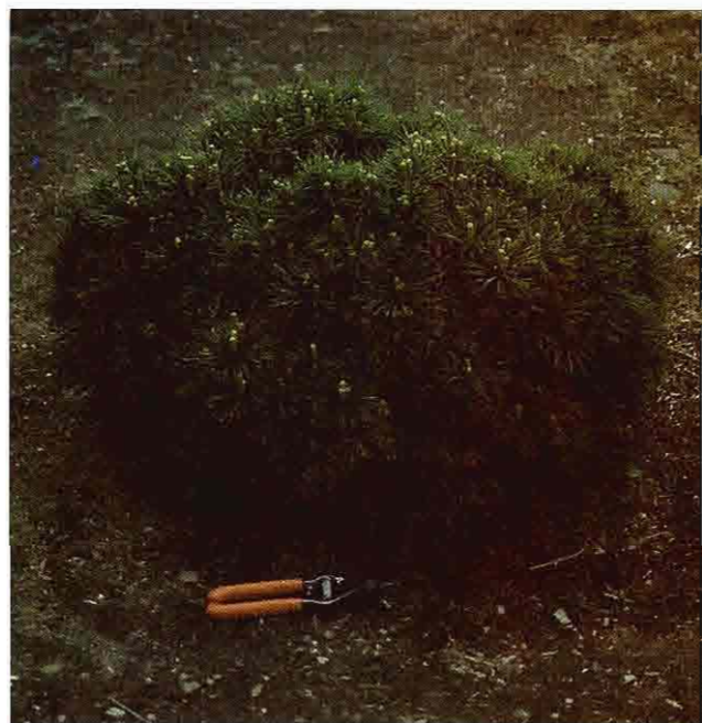
Fig. 3, Pinus strobus 'Sea Urchin'