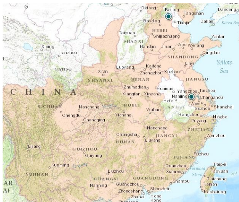
Figure 1 Locations of Beijing and Nanjing in relation to the native habitat of Scutellaria barbata (represented by shaded areas; map created with http://education.nationalgeographic.com/education/mapping/ ).

Current Western research on the chemistry of S. barbata has documented the presence of an array of compounds including flavones and diterpenes with anticancer properties (Wang and Wong, 2011). From BZL101, five active compounds were identified (Fig. 2) (Chen et al., 2012). Among these, flavones such as apigenin and luteolin are well-known to have anticancer activity (Chen et al., 2012; Kim et al. 2005). Chen et al. (2012) found that apigenin exhibited appreciable cytotoxic activity against erythroleukemia (K562), gastric cancer (MGC-803), promyelocytic leukemia (HL60), oral squamous cancer cells (KB) and neuroblastoma (SH-SY5Y). Luteolin was most effective against gastric cancer (MGC-803), promyelocytic leukemia (HL60), and neuroblastoma (SH-SY5Y), liver cancer (SMC-7221) and colon cancer (SW480) (Kim et al., 2005). However, apigenin and luteolin were reportedly non-selective showing cytotoxicity to