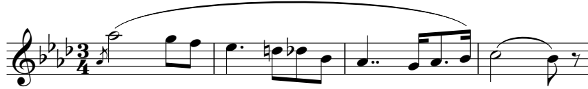
Figure 10. Weber, Concerto No. 1 in F minor, Op. 73 (I): Theme B

cadence at measure 130. Once again, this cadence contains an elision into a cadential extension that showcases the clarinet's virtuosic capabilities across its clarino range.