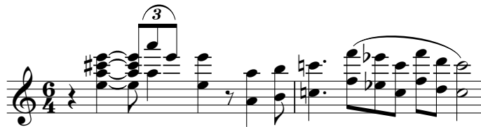
Figure 13. Hindemith, Concerto for Clarinet in A (I): First ritornello theme (R1)

The movement begins with an orchestral introduction in A major with the first ritornello theme, labeled R1 (Figure 13). The theme is passed through the orchestra in the tonic, dominant, and submediant tonalities before reaching a transitional passage at measure 11 that leads to the arrival of the second ritornello theme (R2) at measure 15 (Figure 14). Unlike the first ritornello theme, R2 is not restated in multiple tonalities but maintains the same tonal center of E major each time it is repeated. The theme is presented over dominant harmony, anticipating other harmonic events later in the movement. The statement of R2 concludes at measure 28 when a repeated segment from R1 creates the transition into the first solo section.