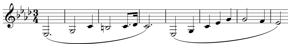
Figure 11. Weber, Concerto No. 1 in F minor, Op. 73 (I): New theme as shown at measure 170.

The development section begins with a new theme in C minor (Figure 11) that lasts eight measures before a modulating phrase tonicizes B-flat major with a development of theme B at measure 184. A cadential extension at 192 gives the clarinet another opportunity to showcase its virtuosity in similar style as before, but in this new key. The last measure of the extension marks a modulation to G minor, with a perfect authentic cadence at measure 198. While the clarinet continues with its virtuosic scalar passages, the ritornello theme appears in the orchestral winds, first in G minor, and then modulates as the harmonic progression in the strings effects a modulation back to the original key of F minor. At measure 223, the harmony arrives at the dominant of F minor while the fragments of the ritornello theme in the horns alternate in dialogue with the clarinet's fragments of theme B. These eight measures create a transition back to the tonic key and theme A at measure 231.